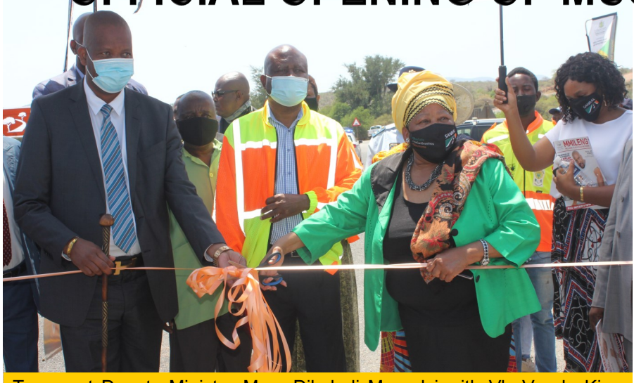
Transport Deputy Minister Mme Dikeledi Magadzi with VhaVenda King Mphephu Ramabulana during the official opening of Musekwa Road